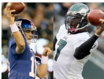
Sneak Peek: Manning v. Vick