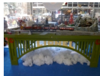
Our Weekend Picks