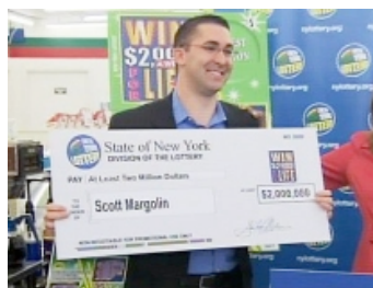
Queens Man Set For Life!