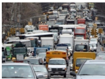
'Tis The (Gridlock) Season